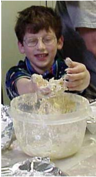
FIRST ANNUAL MATZOH BAKE