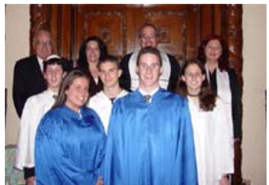
GRADUATION & CONFIRMATION